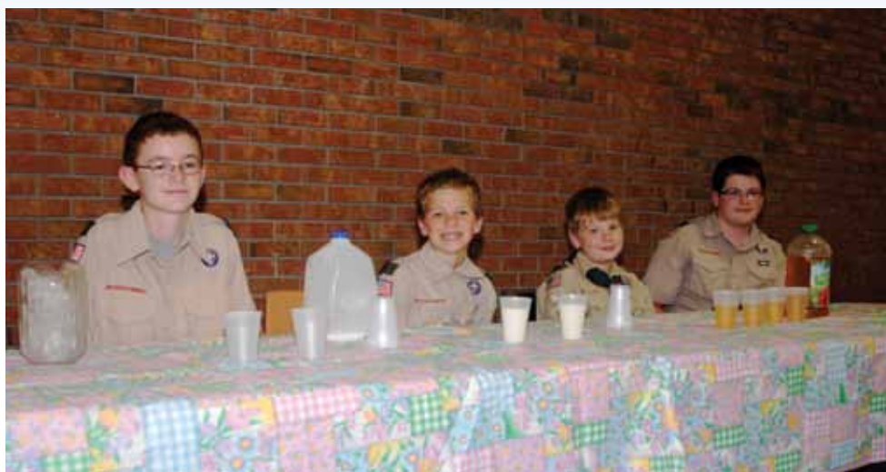
Members of Boy Scouts Troop 425 serve at the Coffee and Donuts fellowship on the first Sunday of the month.

Although Coffee and Donuts is free for all parishioners, donations that go towards certain scouting or ACTS programs are accepted. For example, this past year, various Sundays were designated to raising funds for a Girl Scout trip to Savannah, Ga. — the birthplace of Girl Scouts.