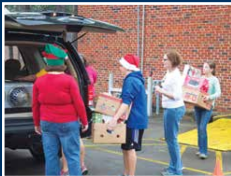
Volunteers helping to load gifts into one family’s trunk