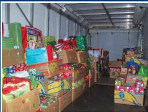
Gifts being loaded into a donated car trailer to be transported to Catholic Charities