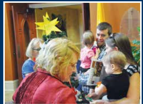
Parishioners choosing tags from the 2013 Angel Tree